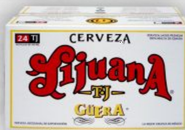
Case Cerveza Tijuana 24 bottles 355 ml.