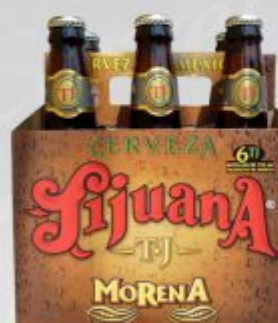
Morena Six Pack 6 bottles 355 ml.