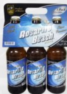
Three Pack "Rosarito Beach" 3 bottles 355 ml.