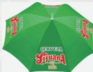
Logo on Umbrella