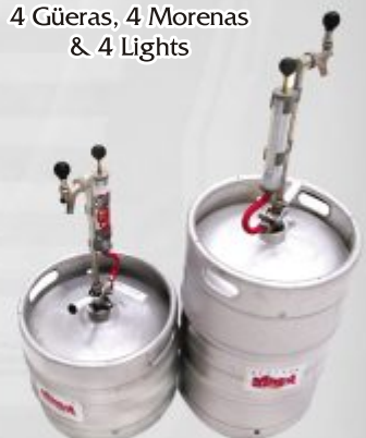
Keg 60, 30 & 20 Lts.