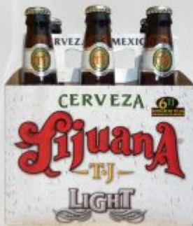
Light Six Pack 6 bottles 355 ml.