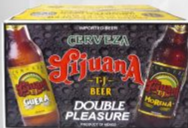
Case Double Pleasure 24 bottles 355 ml. 12 Güeras & 12 Morenas