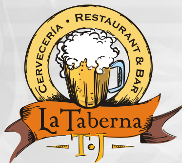
Restaurant Oficial Logo