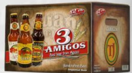
Case 3 Amigos 12 bottles 355 ml. 4 Güeras, 4 Morenas & 4 Lights