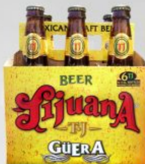
Güera Six Pack 6 bottles 355 ml.