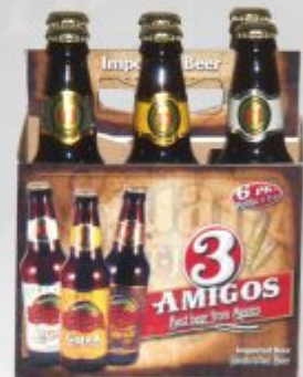
Six Pack 3 Amigos 6 bottles 355 ml. 2 Güeras, 2 Morenas & 2 Lights