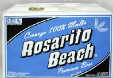
Case Rosarito Beach 24 bottles 355 ml.