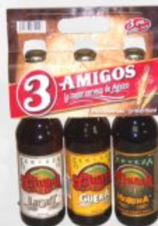
Three Pack 3 bottles 355 ml. 1 Güera, 1 Morena & 1 Light