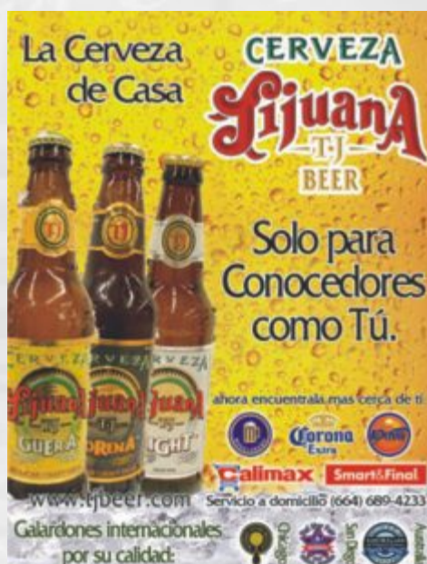
Publicity in Magazines